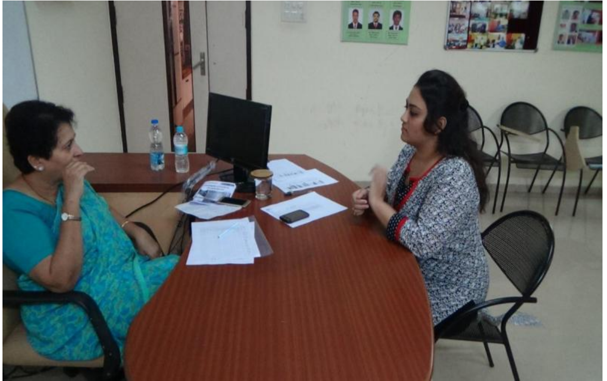
Fig 2: Panel Interviews conducted By Dr Jyoti Gogate